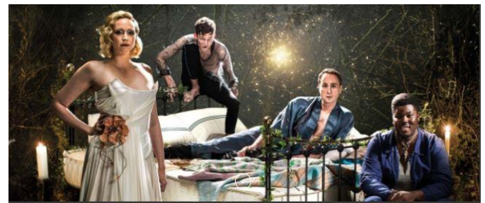
A Midsummer Night's Dream (London Theatre Company)

It has been devastating for industry professionals and theatre lovers during this time; we are anxiously waiting to hear news of when it can begin its recovery. MTC was forced to cancel 11 out of 12 productions this 2020 season and many jobs are at a standstill.